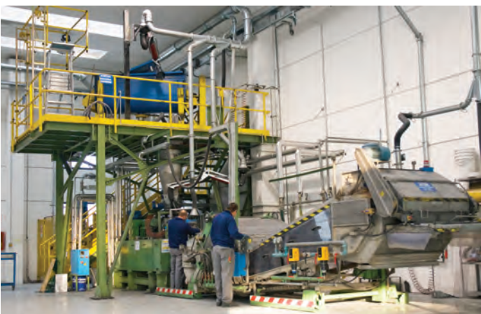
The new facility for housing the powder extruder and cooling belt.

Dave Willis adds, "Finally we have the presence in this key European market that we have wanted for many years".