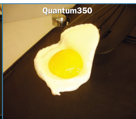
The fourth egg fried on the ungreased griddle with Quantum350 lifted off with no residue. A “pass”, a “pass”, a “pass” and a “pass”.