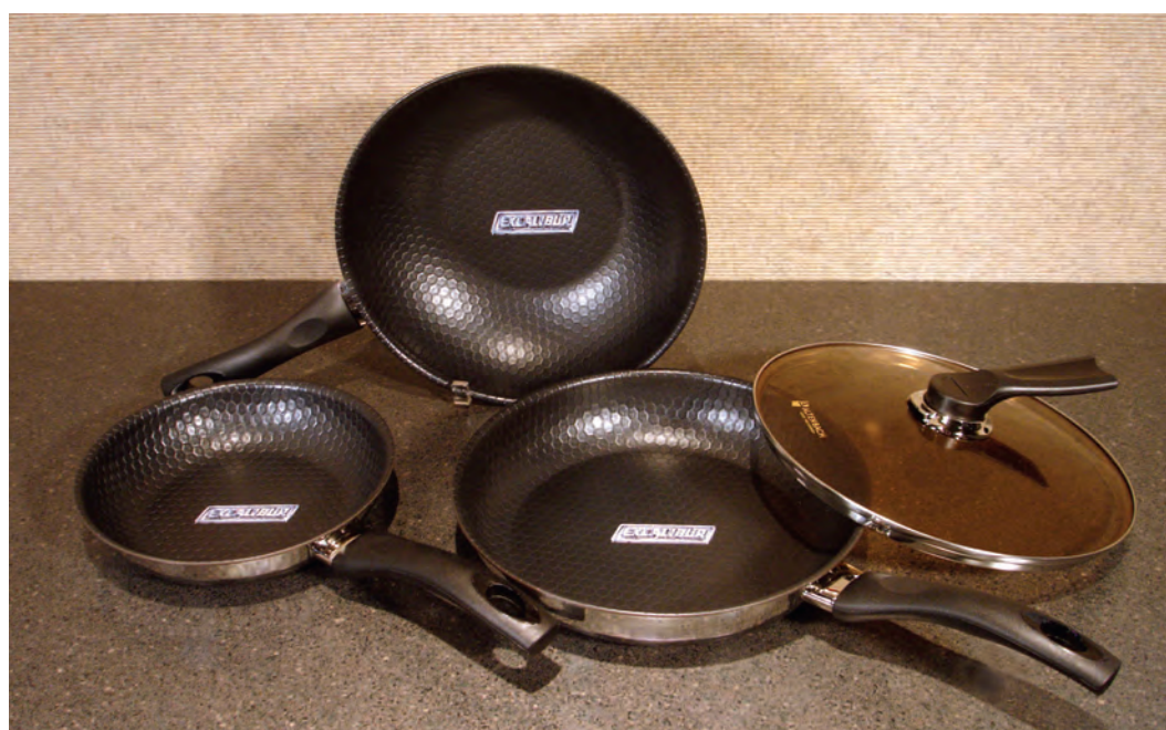
Excalibur, launched by Whitford in 1985, carried nonstick coatings to the very top end of stainless-steel cookware with its externally reinforced stainless-steel matrix system. It is still going strong, the favorite of many stainless-steel cookware manufacturers and their happy customers.

works perfectly on induction and all other stovetop heating systems.