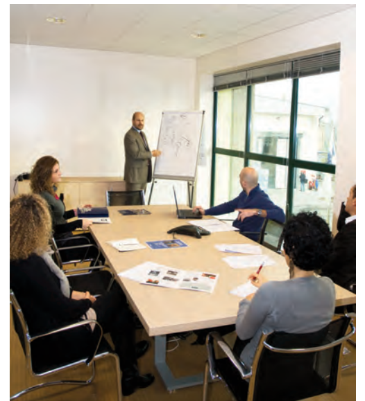
One of several new conference rooms in the significantly expanded Italian facility.

Says Chicco Vallaperta: "Joining forces was the right move for all of us in Whitford Italy, as well as for our customers".