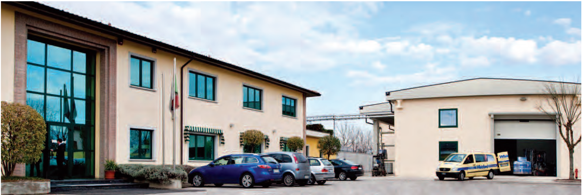
Whitford Italy's offices are on the left, housing customer service, purchasing, main laboratory, sales, administration, management plus three meeting rooms, a small dining room and archives. To the right are the new structures: the warehouse, special laboratory for powders, housing for the new powder production equipment.