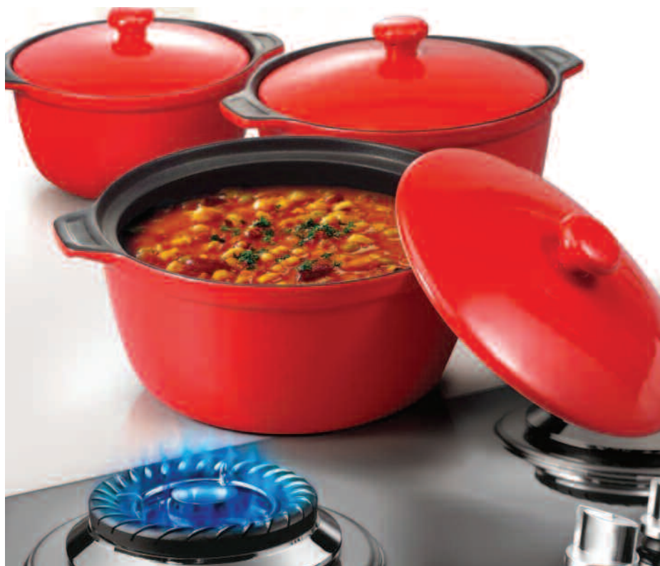
The magic of ZhongYe's cookware is a silver alloy under the Xylan coating.

ZhongYe is a major manufacturer of porcelain/ceramic cookware items, founded in 1990 and located in Chao Zhou, in Guang Dong Province, China.