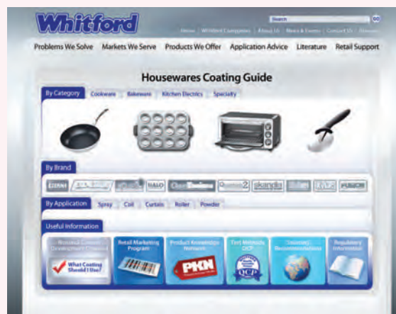
On the left is the home page of Whitford's new website. With one simple click on “Housewares”, the visitor is taken to the Housewares Coating Guide (shown at the right), where finding all the information you might want is easy.

As part of Whitford's continuing investment in new technology, a giant step has been taken in terms of updating, redesigning and improving navigation on Whitford's website, which includes a massive amount of information.