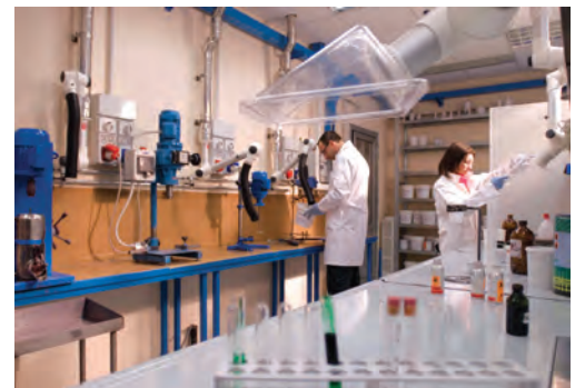
Whitford Italy has invested heavily in new lab equipment as part of its expansion.