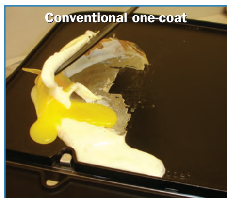
In the Dry-Egg test, the first egg fried on the conventional one-coat stuck fast to the surface of the ungreased griddle. A “fail”.

A typical cure graph illustrates how the problem of blisters begins to skyrocket at approximately 380°C/715°F.