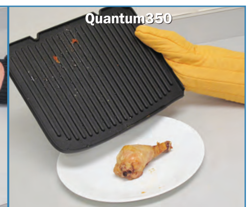
The grilled chicken on the grill coated with Quantum350 did not stick, but released and fell off the surface. A perfect “pass”.