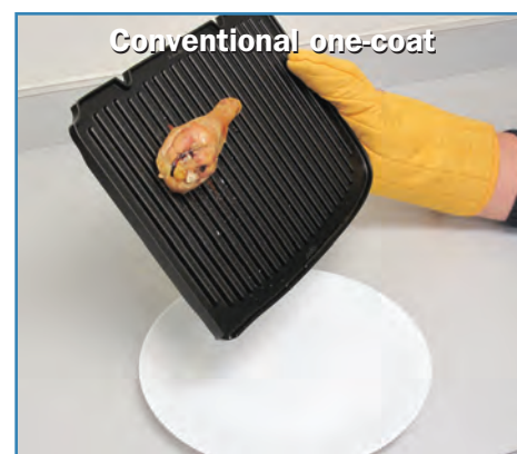
In the Grilled-Chicken test, the first piece stuck to the grill with the conventional one-coat. Rated a “fail”.