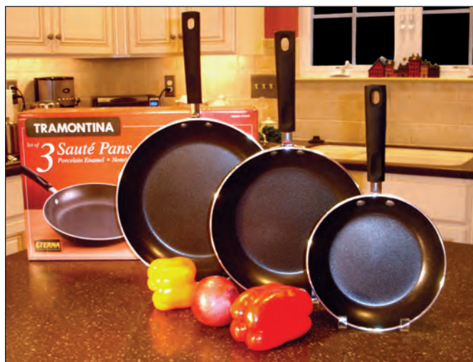
Tramontina offers a popular line of three aluminum sauté pans with porcelain enamel exteriors, all coated with Eterna.

1. Impermeability: The breakthrough technology behind Eterna results in an extremely dense topcoat, especially compared to other top-end nonsticks. Since small cracks or fissures in the topcoat provide a footing for foodstuffs to collect, Eterna’s denser, smoother surface keeps such remnants from building up and inter-