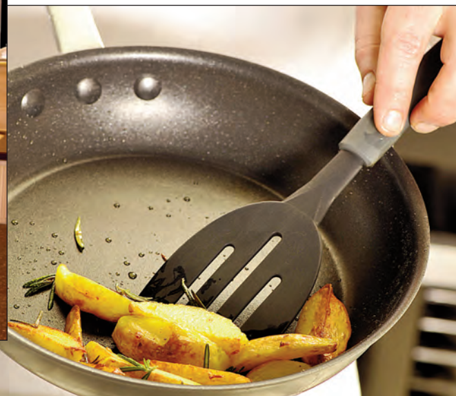
Professional chefs in the United States and Europe are already using industrial frypans coated with Eterna and, to date, the comments have all been highly favorable. Along with the long-lasting nonstick, they like being able to cook with little or no oil for more healthful meals.