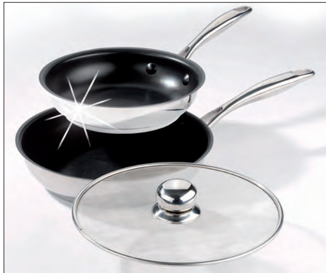
WARIMEX from Germany offers "Eternity", a high-quality, stainless-steel line with a variety of pots and pans using Eterna.

As of this writing, more than 20 major manufacturers have cookware lines with Eterna on the selling