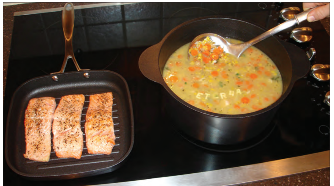
The griddle and stockpot come from Regalware's new 10-piece set of high-end aluminum and stainless-steel cookware, with Eterna on the griddle, stock pot, and fry pan.