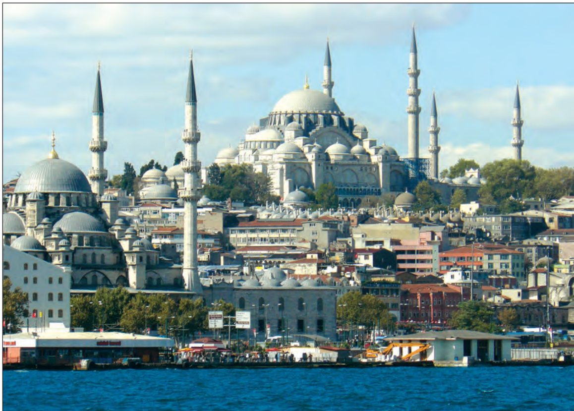
A classic view of the famous Süleymaniye Mosque from the Bosphorus. The Mosque was built in 1550-1557 on the second hill of Istanbul and is one of the most recognized and visited tourist sites in Turkey.

Given its importance (a market of some 77 million people), Whitford decided to offer a more significant presence, and Whitford Turkey opened its doors in July 2009 in Istanbul. The office includes 130 m 2