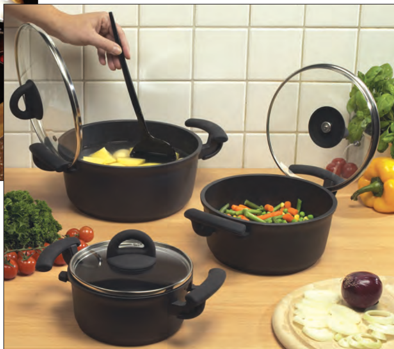
Westfalia’s six-piece Eterna set stresses healthful, fat-free cooking and will be marketed in Austria, Germany, England and Switzerland.

3. User-friendly: Eterna is a two-coat system and is extremely user-friendly. To the cookware manufacturer this means, compared to the usual high-end three-coat sys-