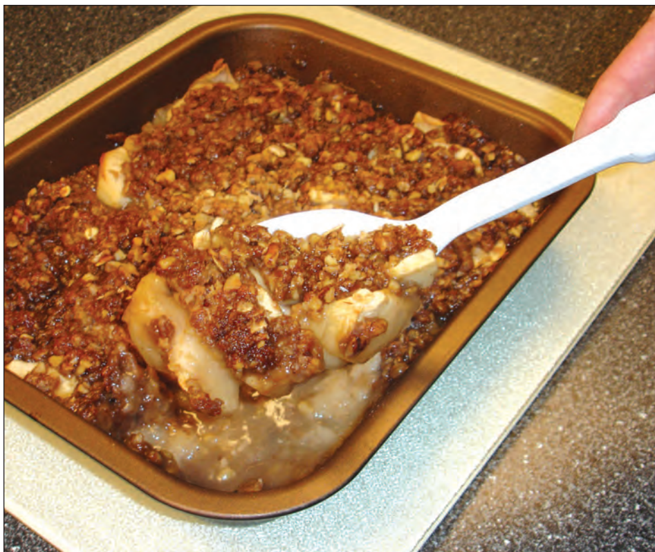
Whitford's test procedures include testing the release of Eterna-coated bakeware used to bake high-sugar-content products such as apple crisp. The release is superb.