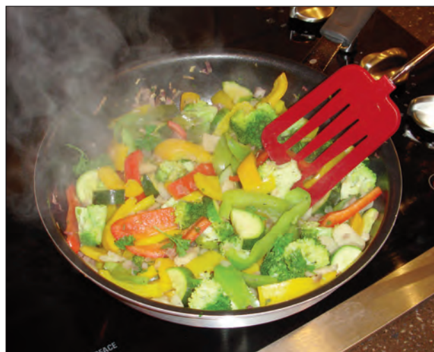
Cooks (JCPenney) presents a new line of NSF-approved, restaurant-quality fry pans in 8-, 10- and 12-inch diameters.