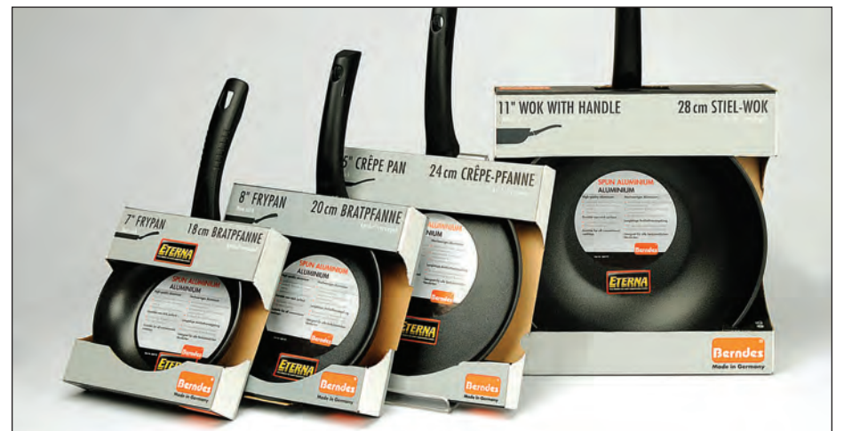
Berndes of Germany recently launched a top-end line of heavy-gauge aluminum cookware coated with Eterna for export markets.

floor, and many more are running trials.