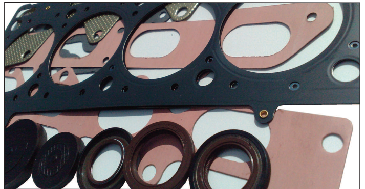
Xylan powder coatings are ideal for gaskets and other small mechanical parts.

Silicon resin-based powder coatings that withstand high-heat service-temperature exposure up to 550°C/1000°F. Designed for excellent thermal-shock resistance as well as good corrosion resistance.