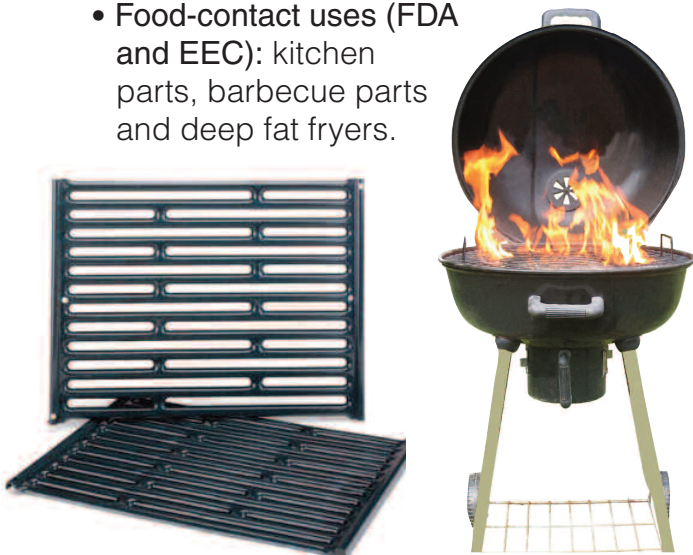
Xylan coatings perform well for stoves, grates and fireplaces where high-heat is a concern.