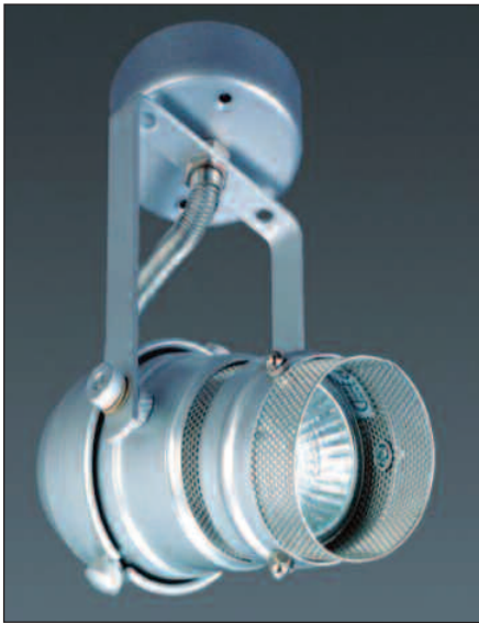
Xylan decorative coatings perform well on halogen lamps, electrical appliances and fireplaces.

Functional powder coatings designed to provide a highly decorative finish to pieces exposed up to 575°F/300°C. Note: Colors do not yellow after exposure to high temperatures.