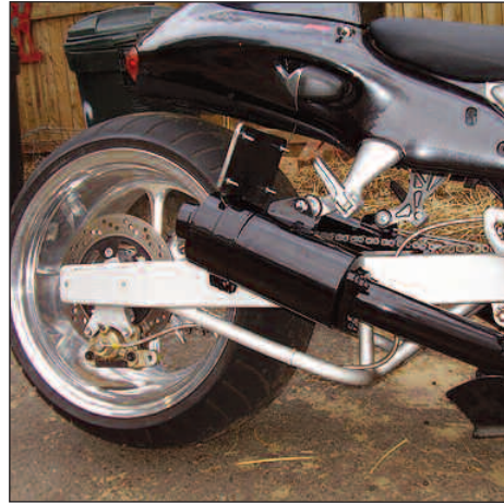
Xylan extremely high-heat powder coatings are designed for use on mufflers, exhaust pipes and engine gaskets for vehicular applications.