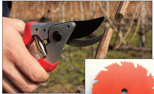
Xylan low-friction coatings reduce friction and increase wear-life of garden shears and saw blades.