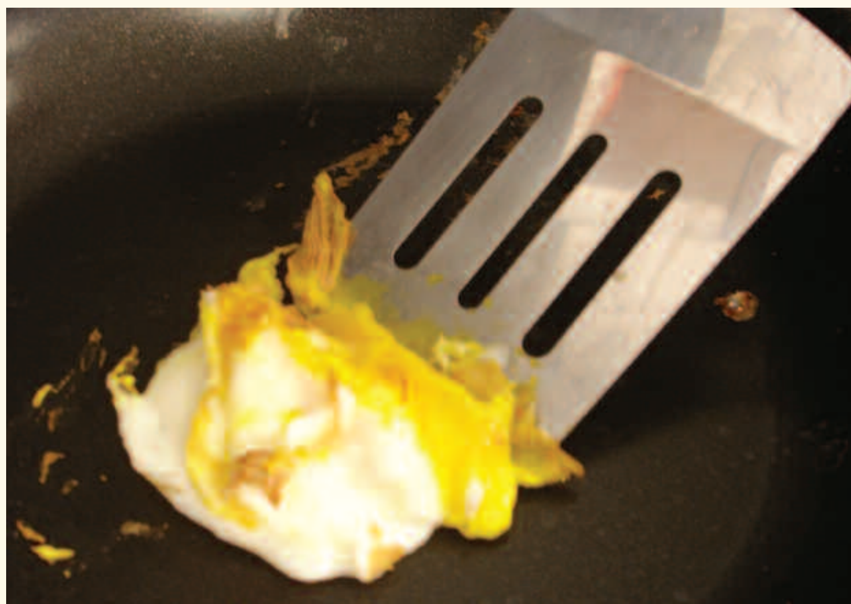
What egg failure looks like in the Dry-Egg Test. This is egg #34 on Nonstick "C", the best of the other three leading nonsticks tested.