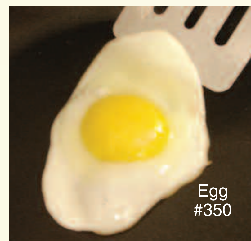
The Dry-Egg test on the new Eterna™ coating at Whitford's laboratory. All these eggs continued to lift easily off the dry surface of the pan, including #350, at which point the test was stopped.